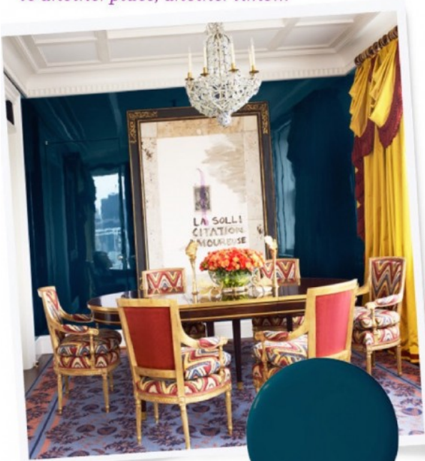
DEEP SAXE BLUE BS113 FINE PAINTS OF EUROPE